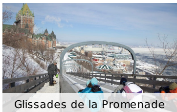
Glissades de la Promenade